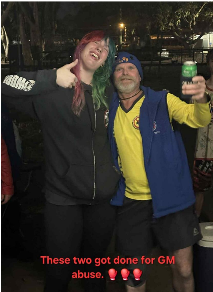
These two got done for GM abuse. 🥊🥊🥊