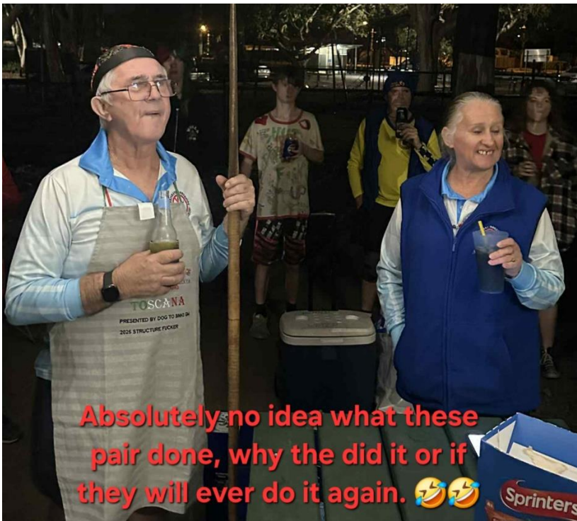
Absolutely no idea what these pair done, why the did it or if they will ever do it again. 🤔🤔