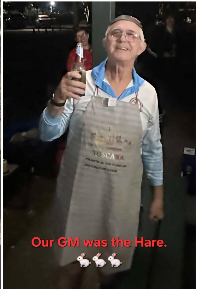
Our GM was the Hare. 🐰🐰🐰