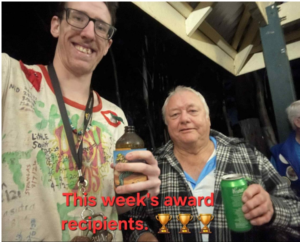
This week's award recipients. 🏆🏆🏆