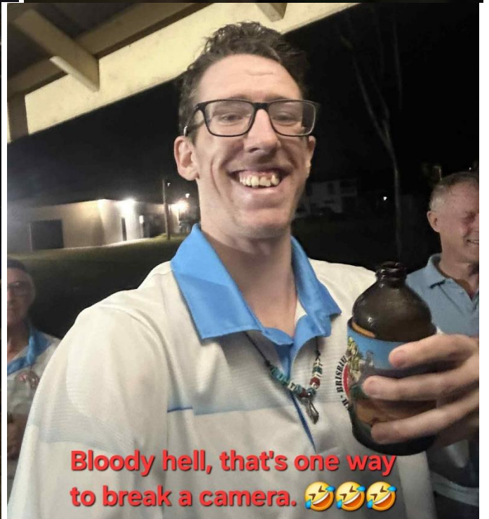
Bloody hell, that's one way to break a camera. 🤪🤪🤪