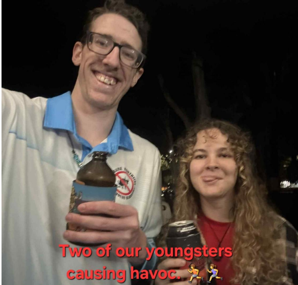
Two of our youngsters causing havoc. 🏃🏃