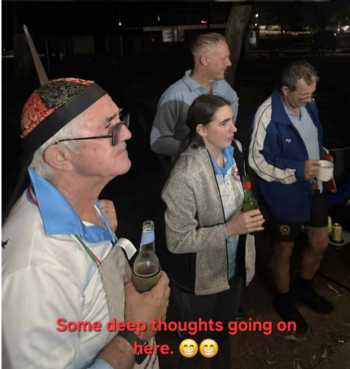
Some deep thoughts going on here. 😏😏