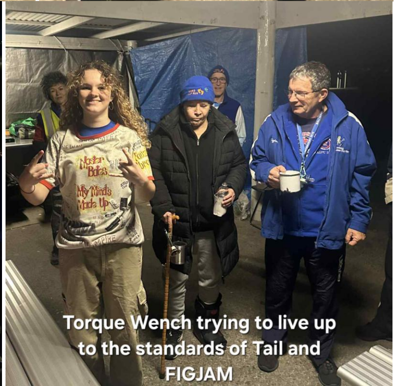
Torque Wench trying to live up to the standards of Tail and FIGJAM