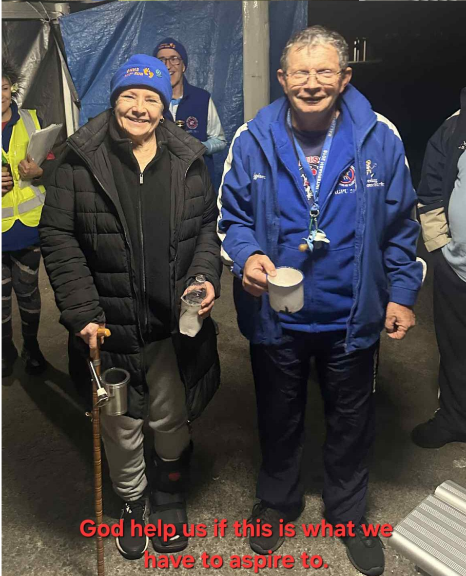
God help us if this is what we have to aspire to.