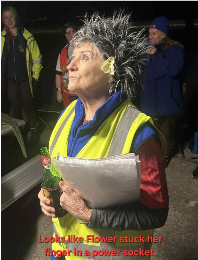
Looks like Flower stuck her finger in a power socket.