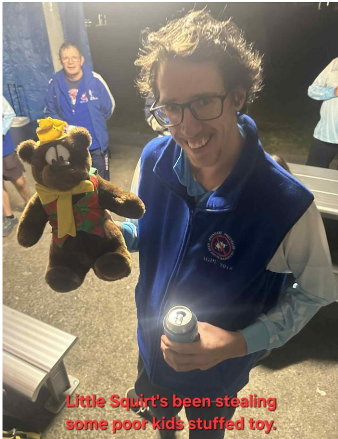
Little Squirt's been stealing some poor kids stuffed toy.