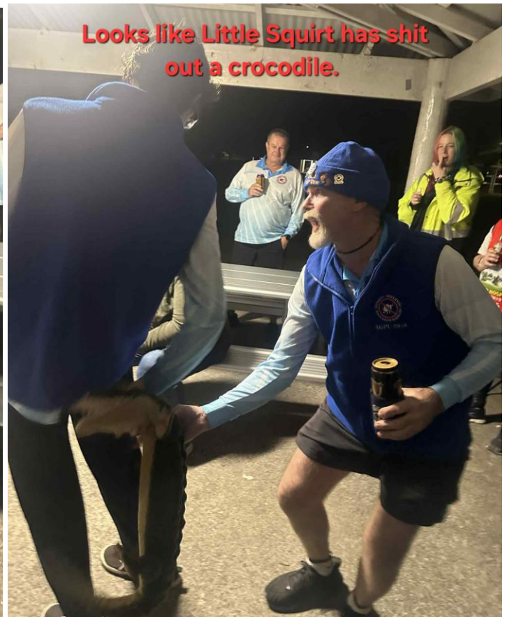
Looks like Little Squirt has shit out a crocodile.