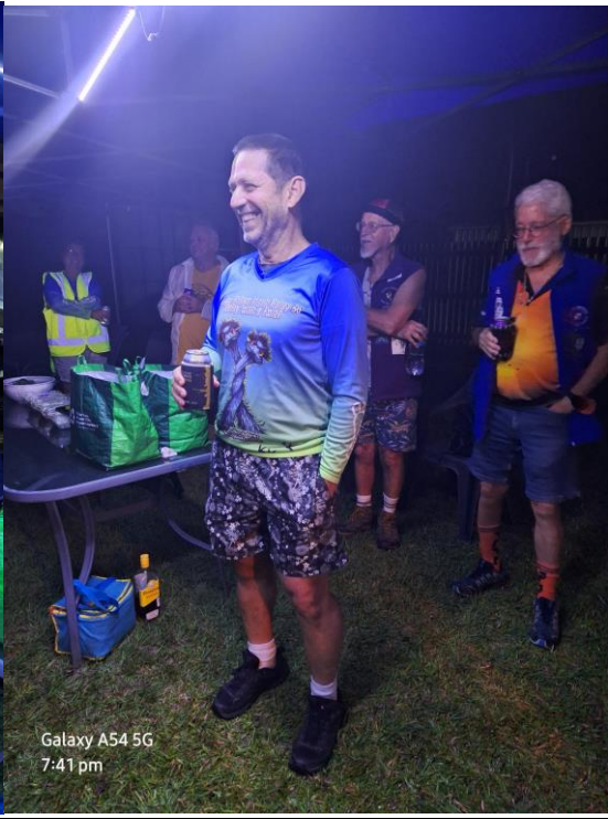
Galaxy A54 5G 7:41 pm