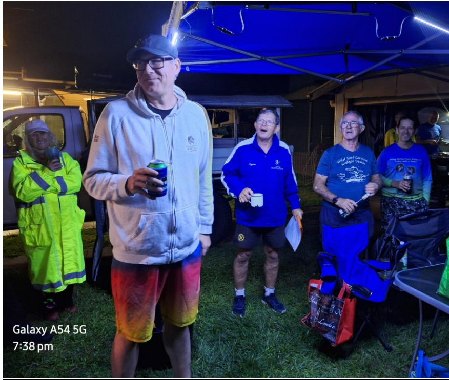
Galaxy A54 5G 7:38 pm