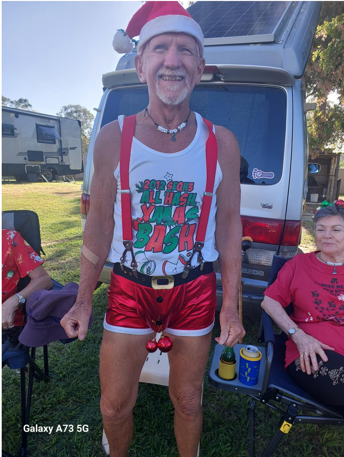
Galaxy A73 5G