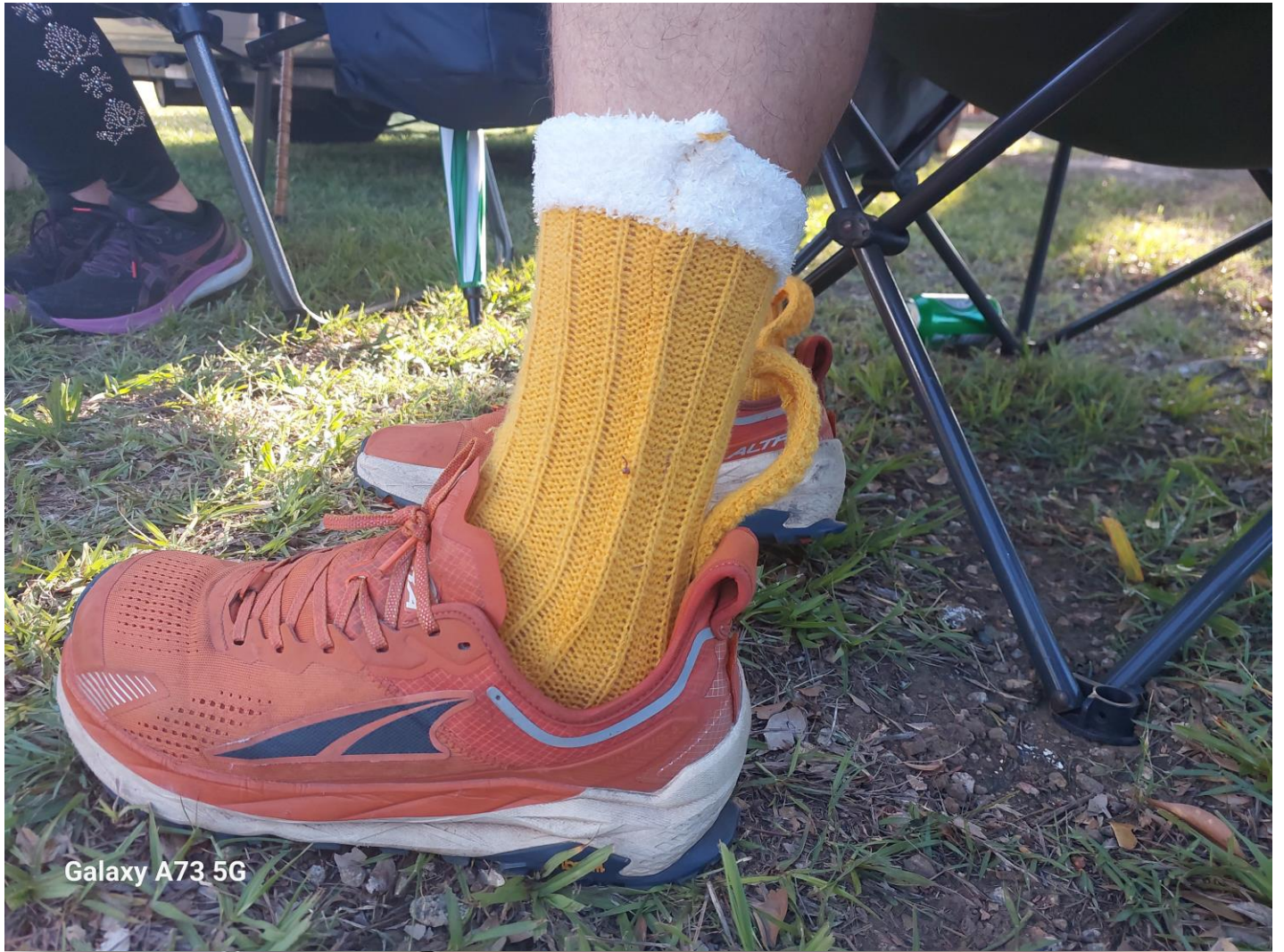
Galaxy A73 5G