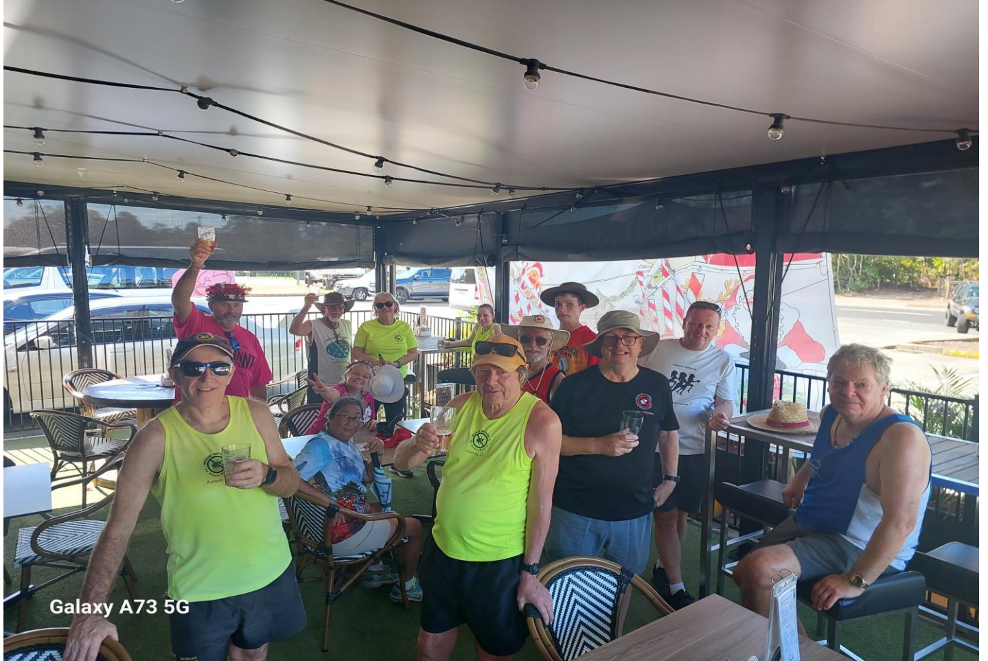
Galaxy A73 5G