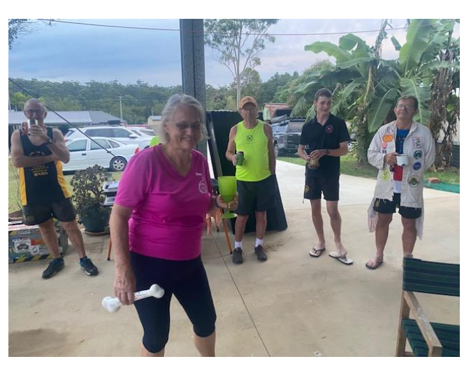
Oh, that's not flattering. No snakes being charmed by this one.