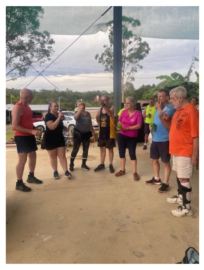
The old committee