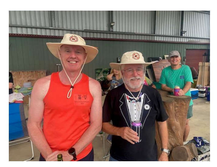
100 Runs = Good guns (at least from one of us)