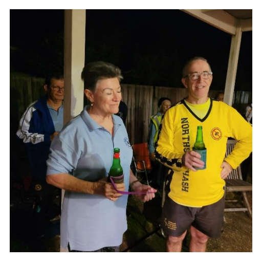
Charges Heartstarter and Overproof- Public displays of affection for the 32<sup>nd</sup> commiserationversary