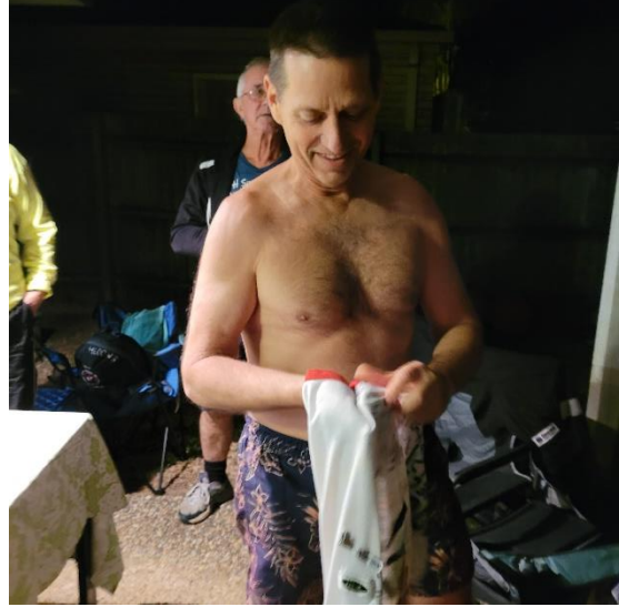
Late Charge Smooth Ride- Name-dropping and making us realise she has an awesome life jet-setting.