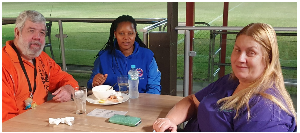
Rabbi, Raw Liver and Sherbet – a rainbow trifecta