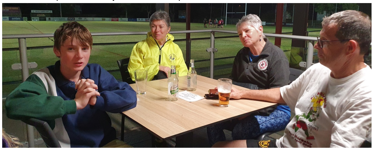
O B One (Kenobi) explains how Fig Jam drank salty whiskey