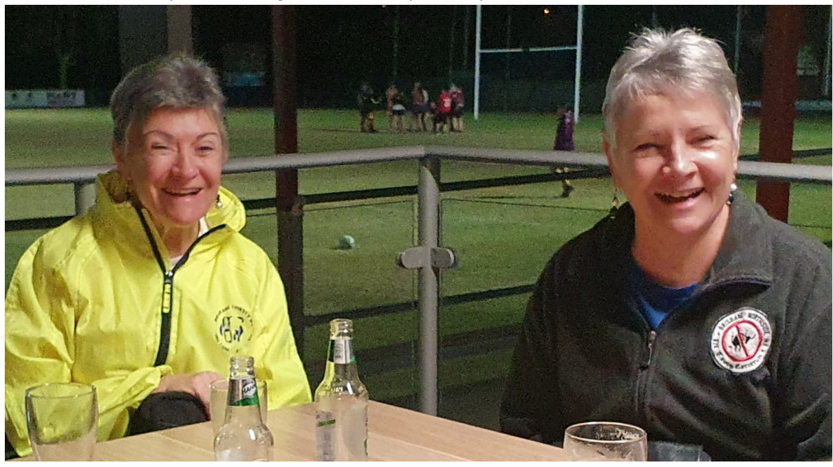
Flower and Tail expressing concern for Fig Jam